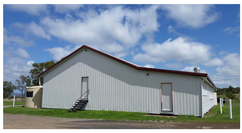
Lawgi Hall Currently