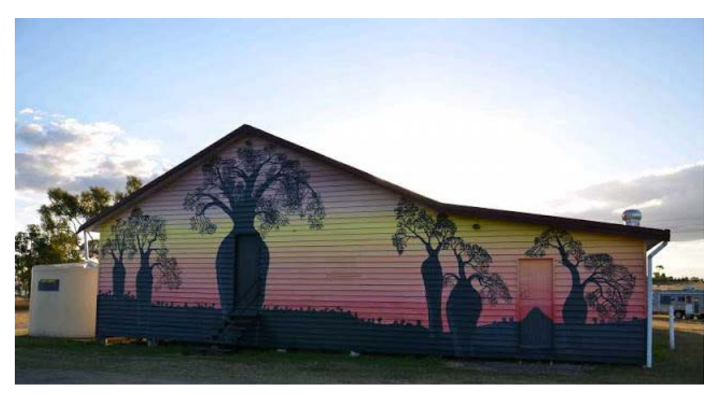
Previous Lawgi Hall Artwork