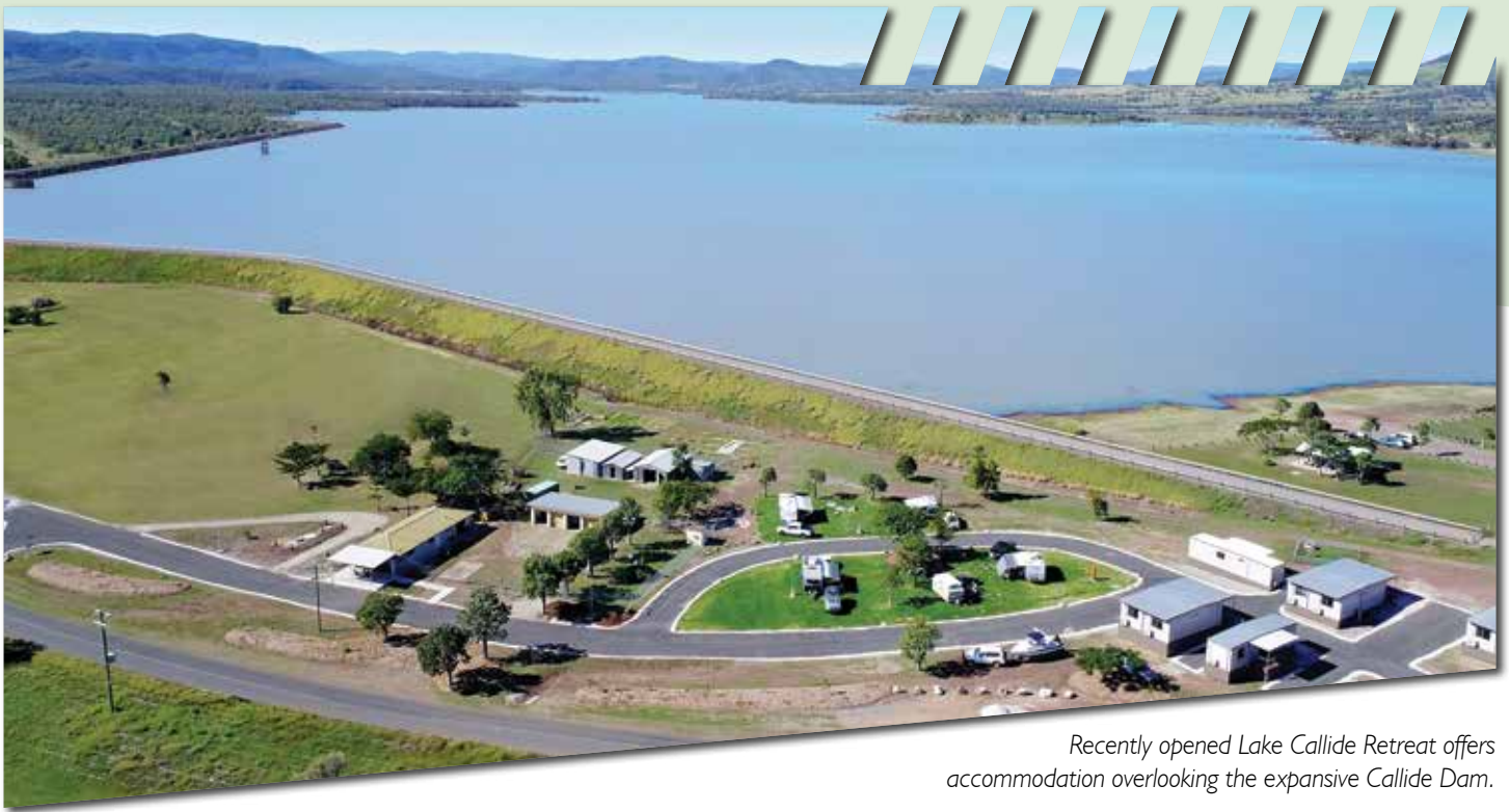
Recently opened Lake Callide Retreat offers accommodation overlooking the expansive Callide Dam.