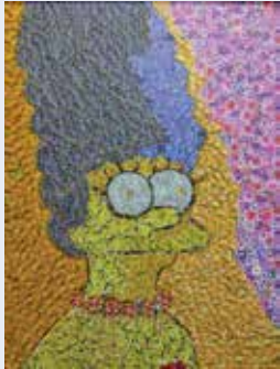
Marlies Oakley Marge Simpson 2014 Postcard collage. Photography by the artist