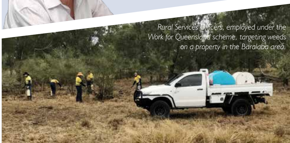
Rural Services Officers, employed under the Work for Queensland scheme, targeting weeds on a property in the Baralaba area.

I will take this opportunity to congratulate the State Government on this funding program. It is a great initiative and has enabled Council to bring forward a number of important projects.