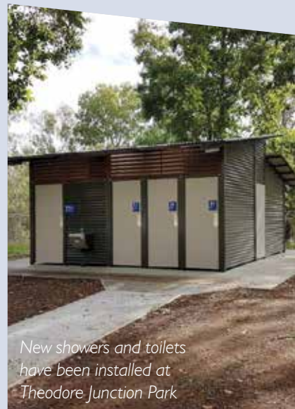
New showers and toilets have been installed at Theodore Junction Park