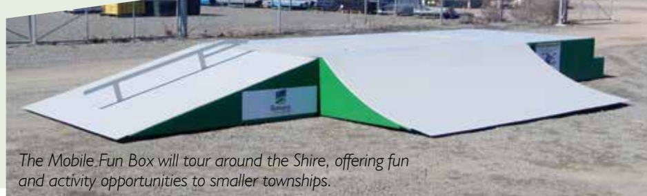
The Mobile Fun Box will tour around the Shire, offering fun and activity opportunities to smaller townships.

Council has installed concrete pads for the unit's use in Wowan and Cracow and the Banana Progress Association has funded the installation of a pad in Banana's Opportunity Park, where the unit was launched.