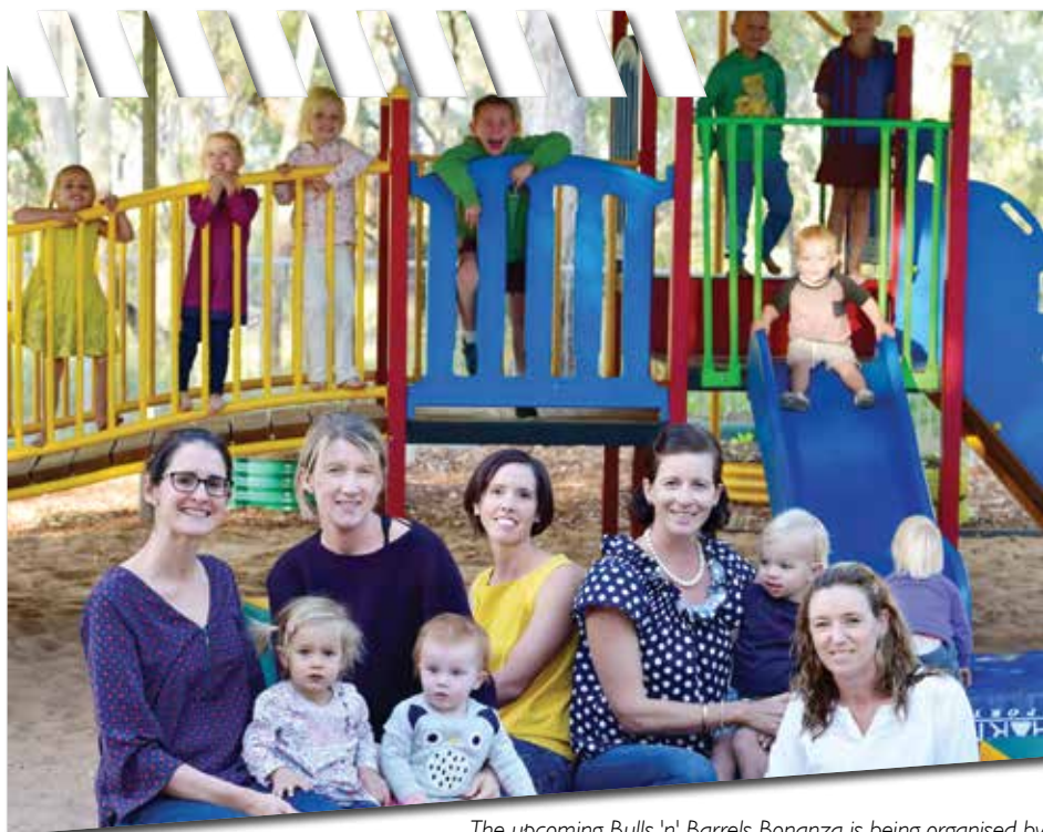
The upcoming Bulls 'n' Barrels Bonanza is being organised by the Theodore Early Childhood Centre committee.