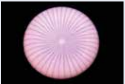
Jo Bone Purple Sand Dollar 2014 Blown glass, cold worked 8 x 38cm