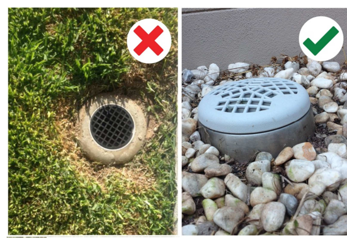
Incorrect and correct way of ORG installation