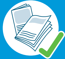
Newspaper and magazines