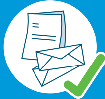
Paper and envelopes