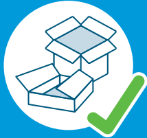
Cardboard boxes and cartons