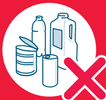
Bottles, cans and other plastics