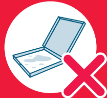
Cardboard heavily contaminated with food or grease