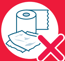
Facial tissues and paper towel