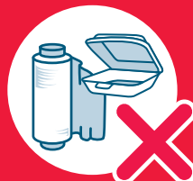
Plastic film, clingwrap, pallet shrink or stretch wrap and polystyrene