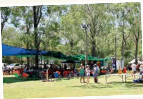
Many Banana Shire residents enjoyed the Australia Day celebration at Baralaba.