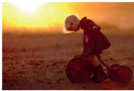
Sunburnt Country by Sarah Warner