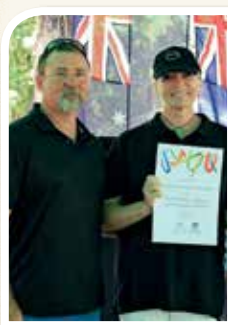
JBOYS Community Group or Team