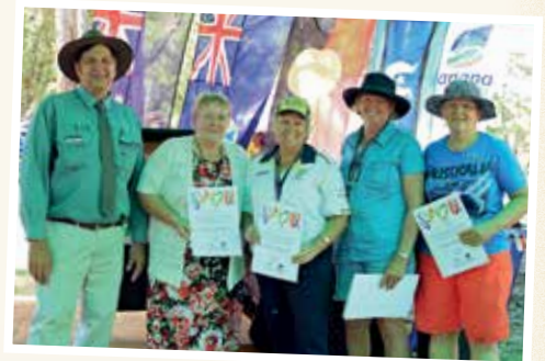
The 2017 Australia Day Working Group.