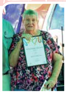
Alva Collocott Volunteer Award