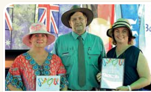
Having a Ball in the Buffel Community Event of the Year Award