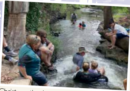
Christmas the Aussie Way by Isobel Rideout