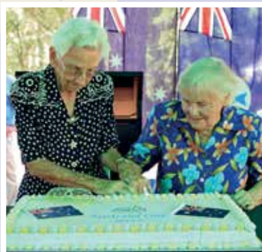
The cutting of the official Australia Day cake.