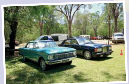
Classic cars on display.