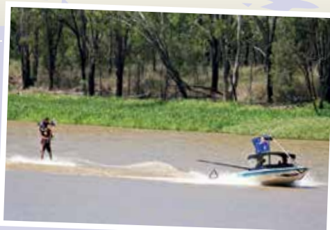
Entertainment included a skiing demonstration.