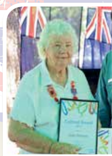
Auda Maclean Cultural Award