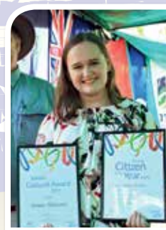
Emma Zillmann Junior Cultural Award